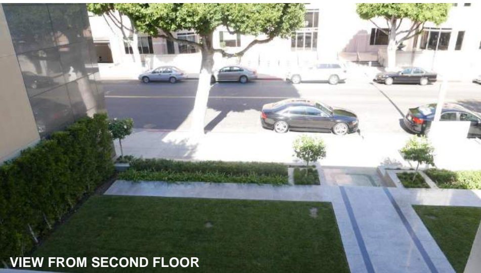
VIEW FROM SECOND FLOOR