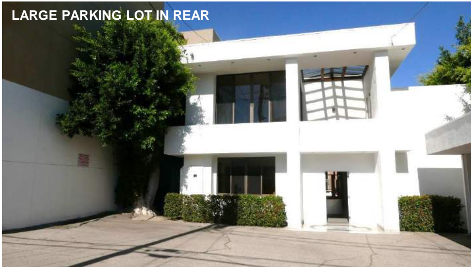
LARGE PARKING LOT IN REAR