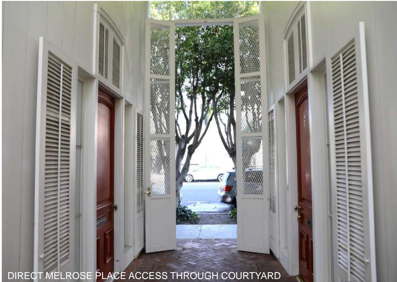
DIRECT MELROSE PLACE ACCESS THROUGH COURTYARD