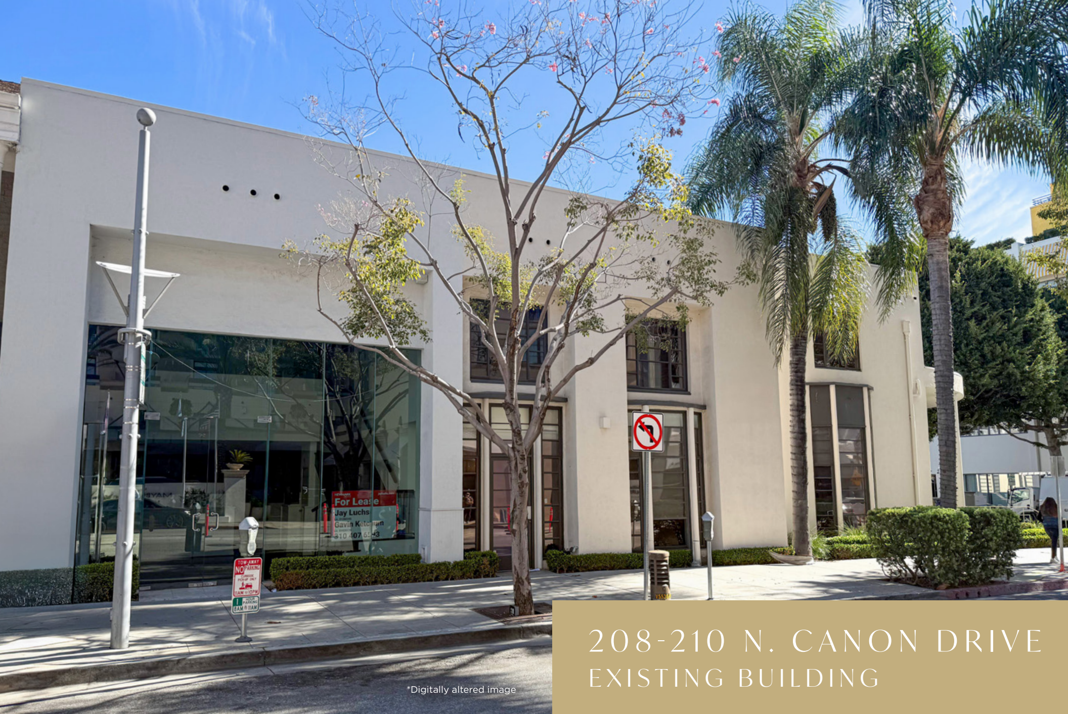
*Digitally altered image