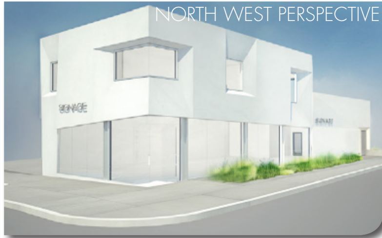
NORTH WEST PERSPECTIVE