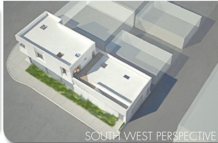
SOUTH WEST PERSPECTIVE