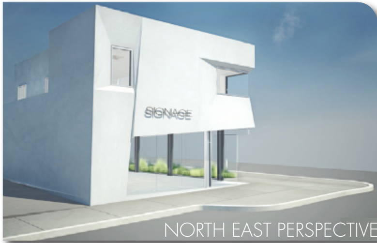
NORTH EAST PERSPECTIVE