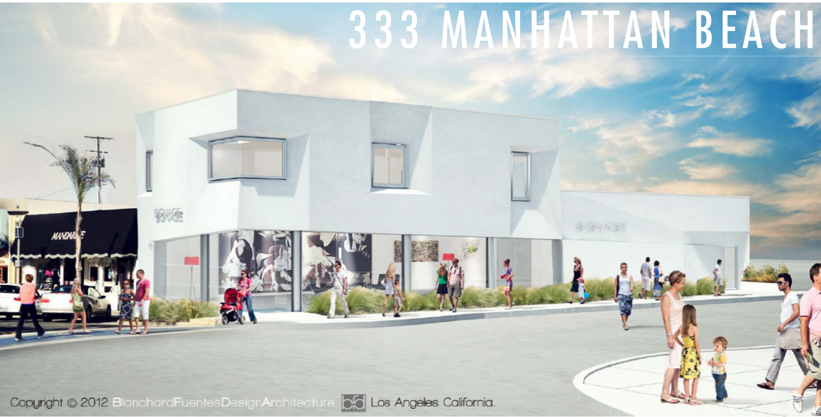
Copyright © 2012 BlanchardFuentesDesignArchitecture Los Angeles California.