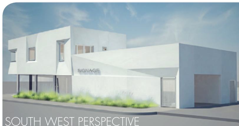
SOUTH WEST PERSPECTIVE