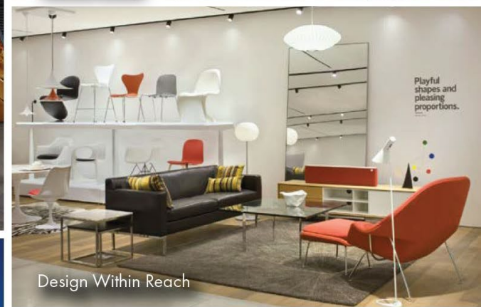
Design Within Reach