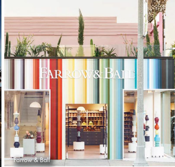
Farrow & Ball