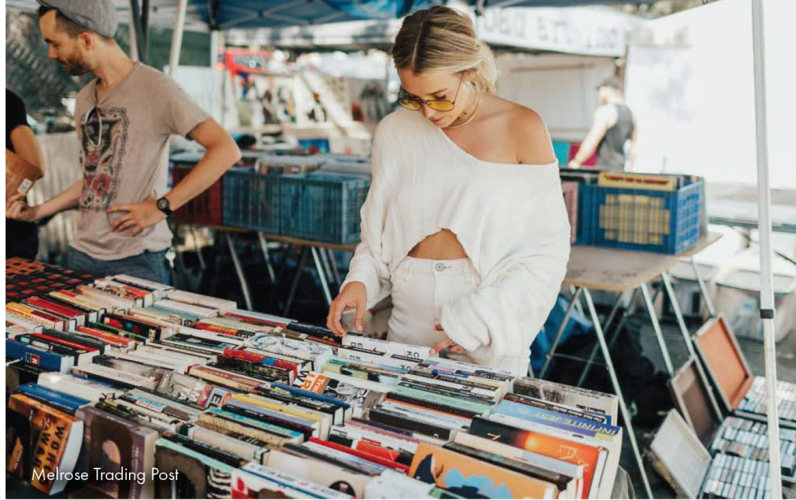
Melrose Trading Post

From Fairfax Ave to Highland Ave, more than 300 alternative and independent stores offers the latest streetwear, vintage fashions, and is home to the Melrose Trading Post. Fairfax Avenue features an assortment of streetwear stores including RIPNDIP, HUF, AAPE, The Hundreds, and more as well as local favorite Jon & Vinny's.