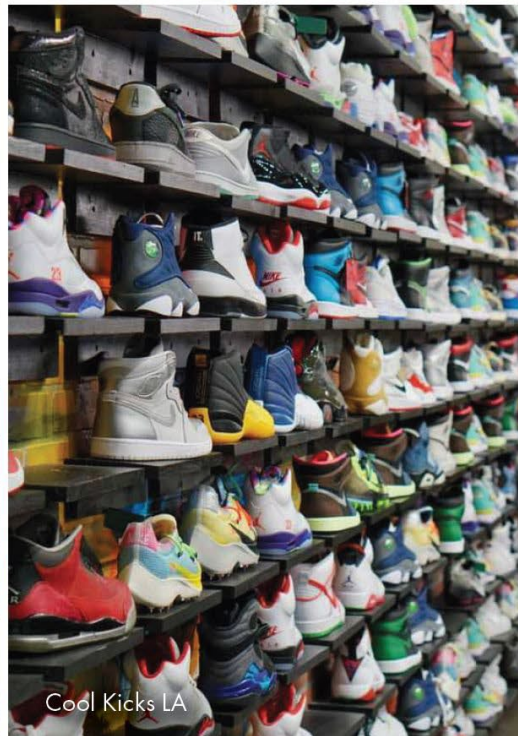
Cool Kicks LA