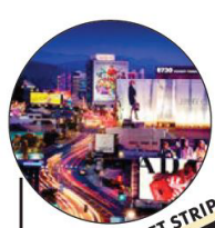
THE SUNSET STRIP