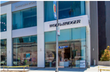
WOLF & BEDGER