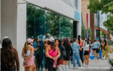
HOKA ONE ONE