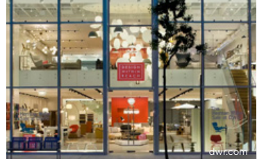
DESIGN WITHIN REACH

The information contained herein has been obtained from sources deemed reliable but has not been verified and no guarantee, warranty or representation, either express or implied, is made with respect to such information. Terms of sale or lease and availability are subject to change or withdrawal without notice.