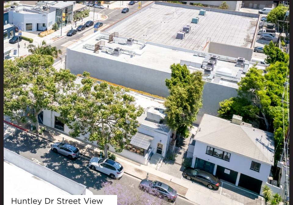
Huntley Dr Street View