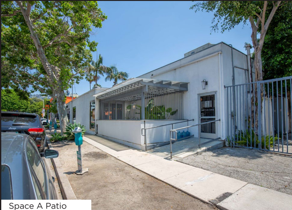
Space A Patio