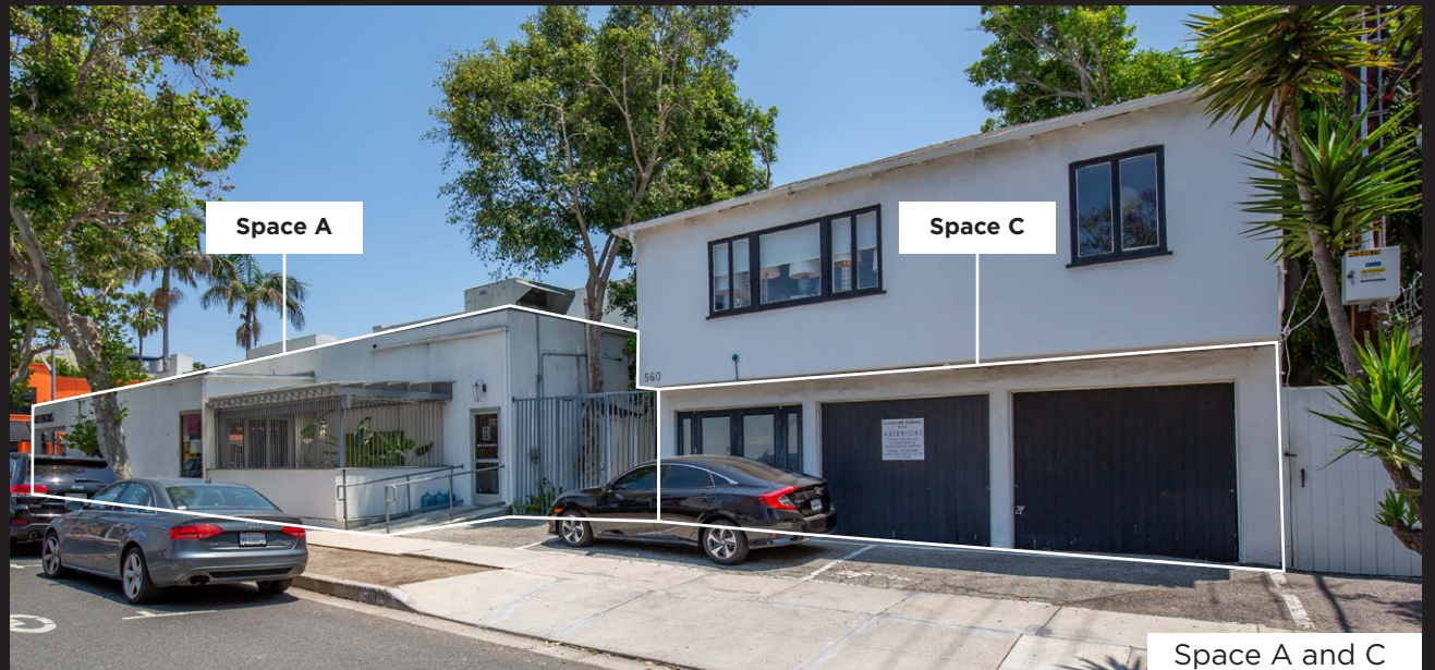
Space A and C