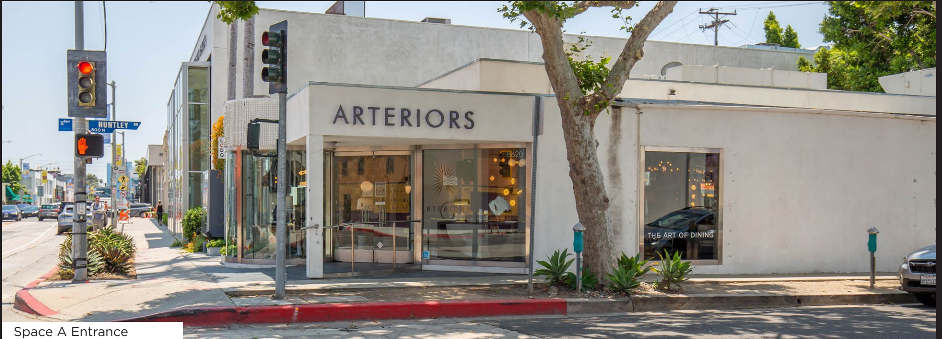
Space A Entrance