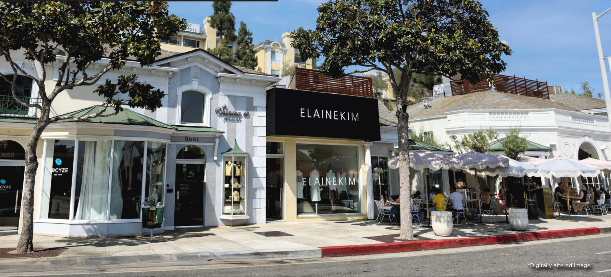
*Digitally altered image

8659 Sunset Boulevard West Hollywood, CA 90069