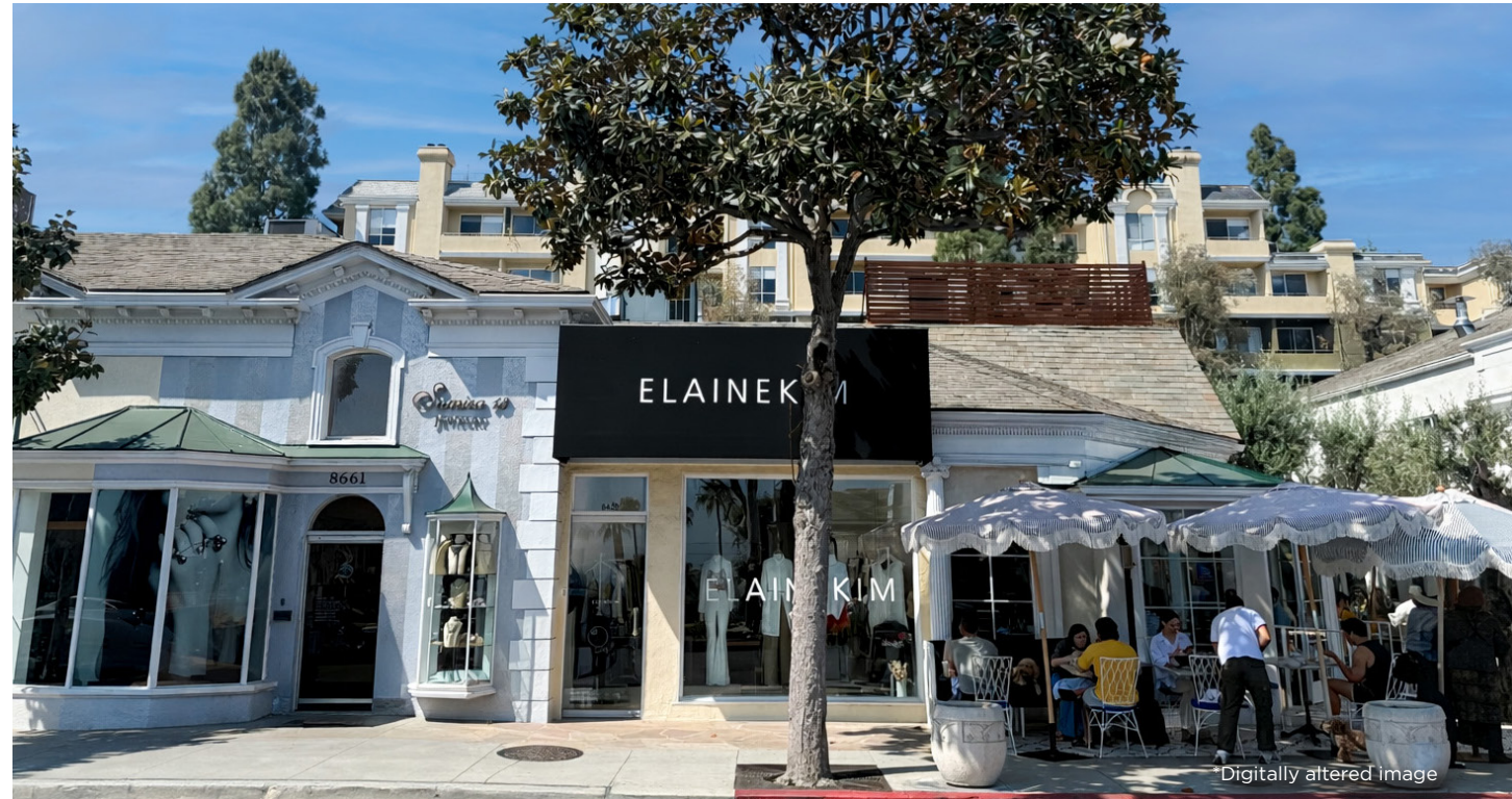
Digitally altered image

Located in the heart of Sunset Plaza, one of West Hollywood's most prestigious and high-traffic retail corridors, this approximately 988 square foot retail space offers a rare opportunity to establish or expand a brand presence along the iconic Sunset Strip. Surrounded by an affluent, design-conscious clientele and anchored by acclaimed restaurants, boutiques, and destination brands, the property benefits from exceptional street visibility and consistent foot traffic from both local residents and international visitors.