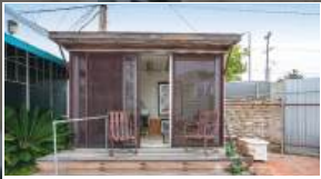
BUILDING A: ±140 SF