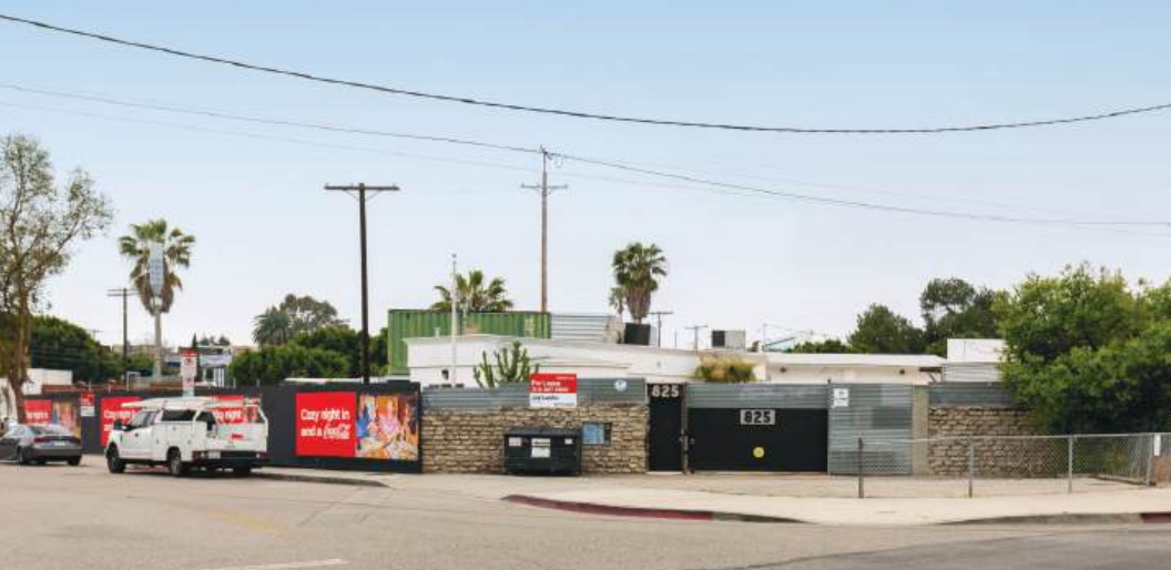
STREET VIEW FROM HAMPTON DR/ELECTRIC AVE