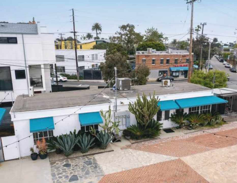
BUILDING B & C