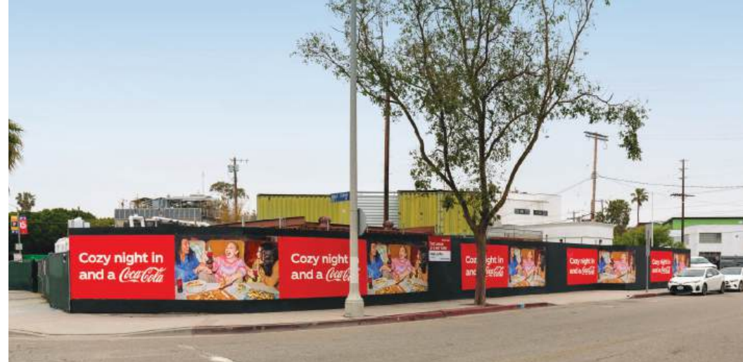
STREET VIEW FROM BROOKS AVE