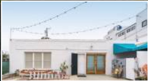
BUILDING D: ±1,500 SF