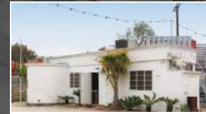
BUILDING F: ±516 SF