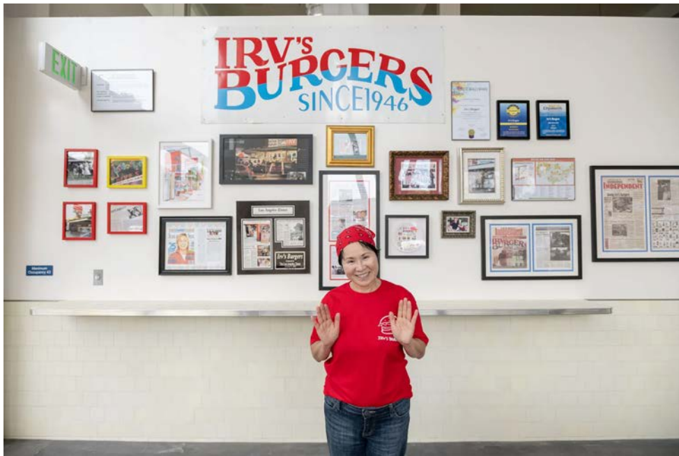
So much history at Irv's Burgers