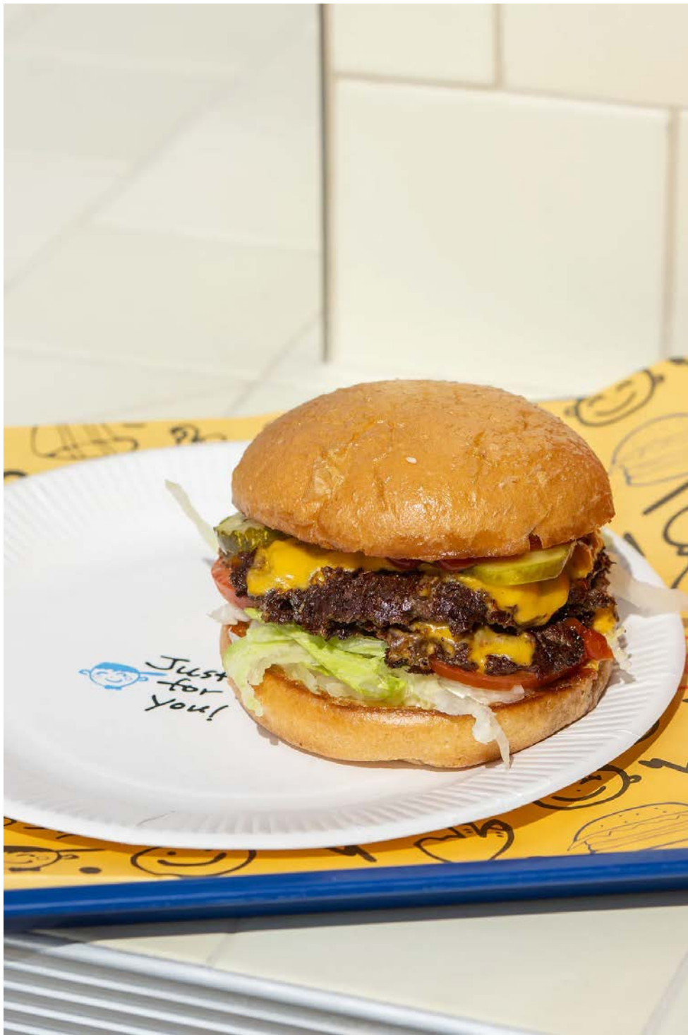
the 'just for you!' plates are back