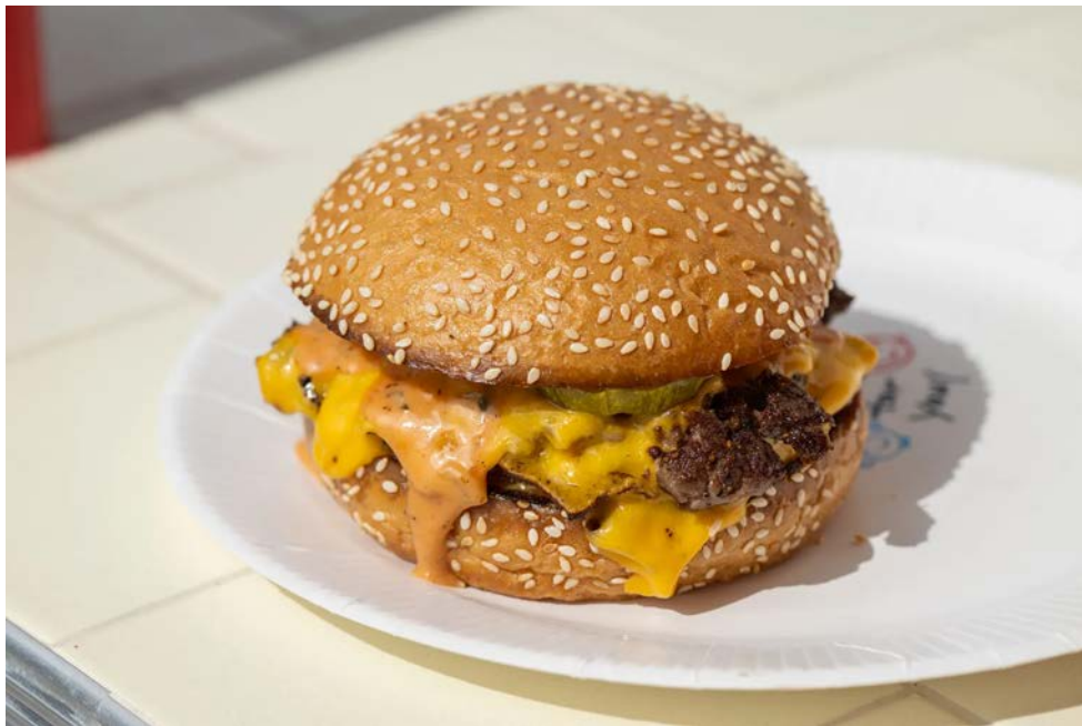
A simple Just For You burger