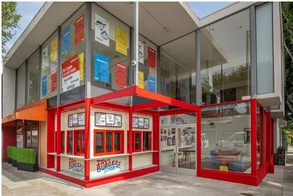
The redone corner with walk-up ordering window