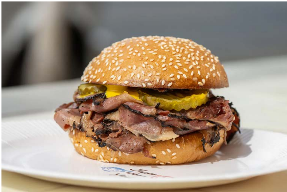
Pastrami and pickles