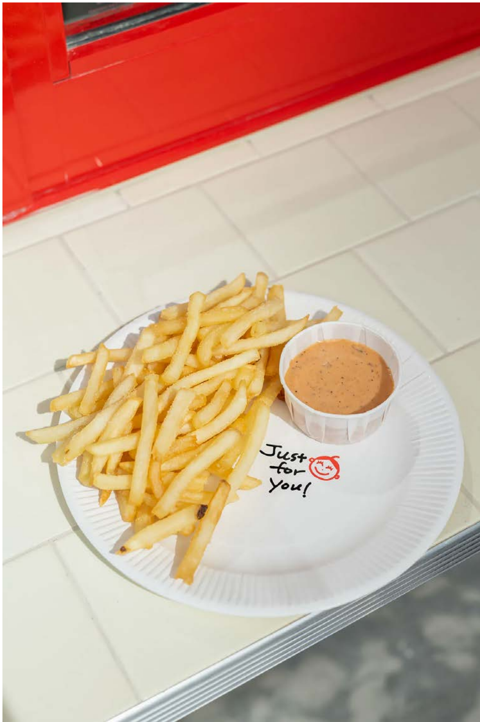
And so are the fries