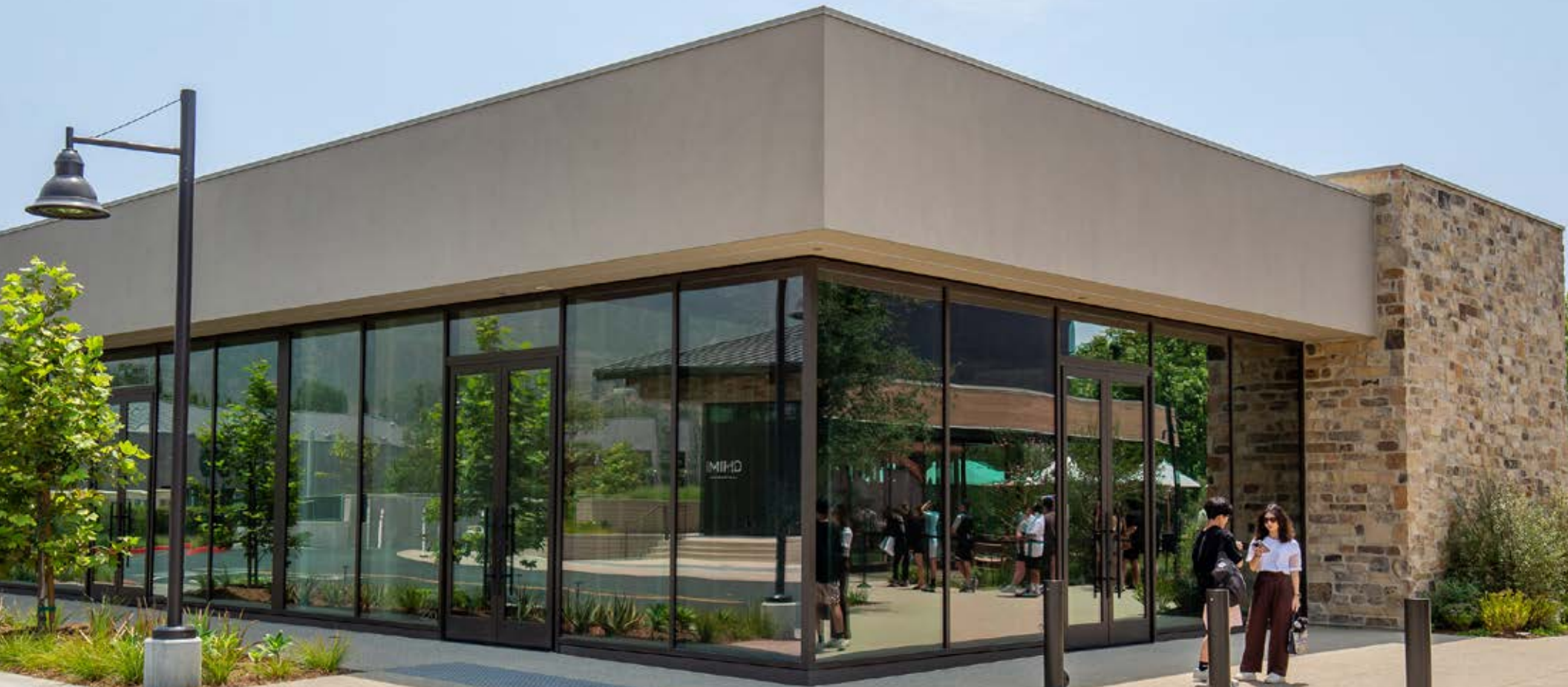
BUILDING 2 / AT VALET