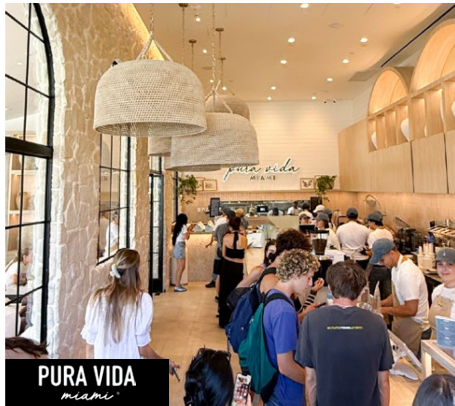
PURA VIDA miami