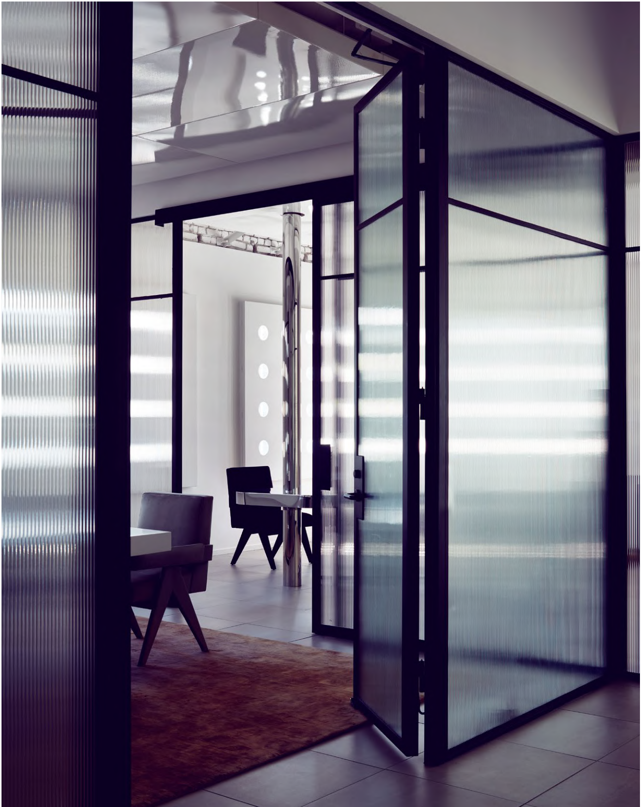
729 Seward St Conference room & private office.