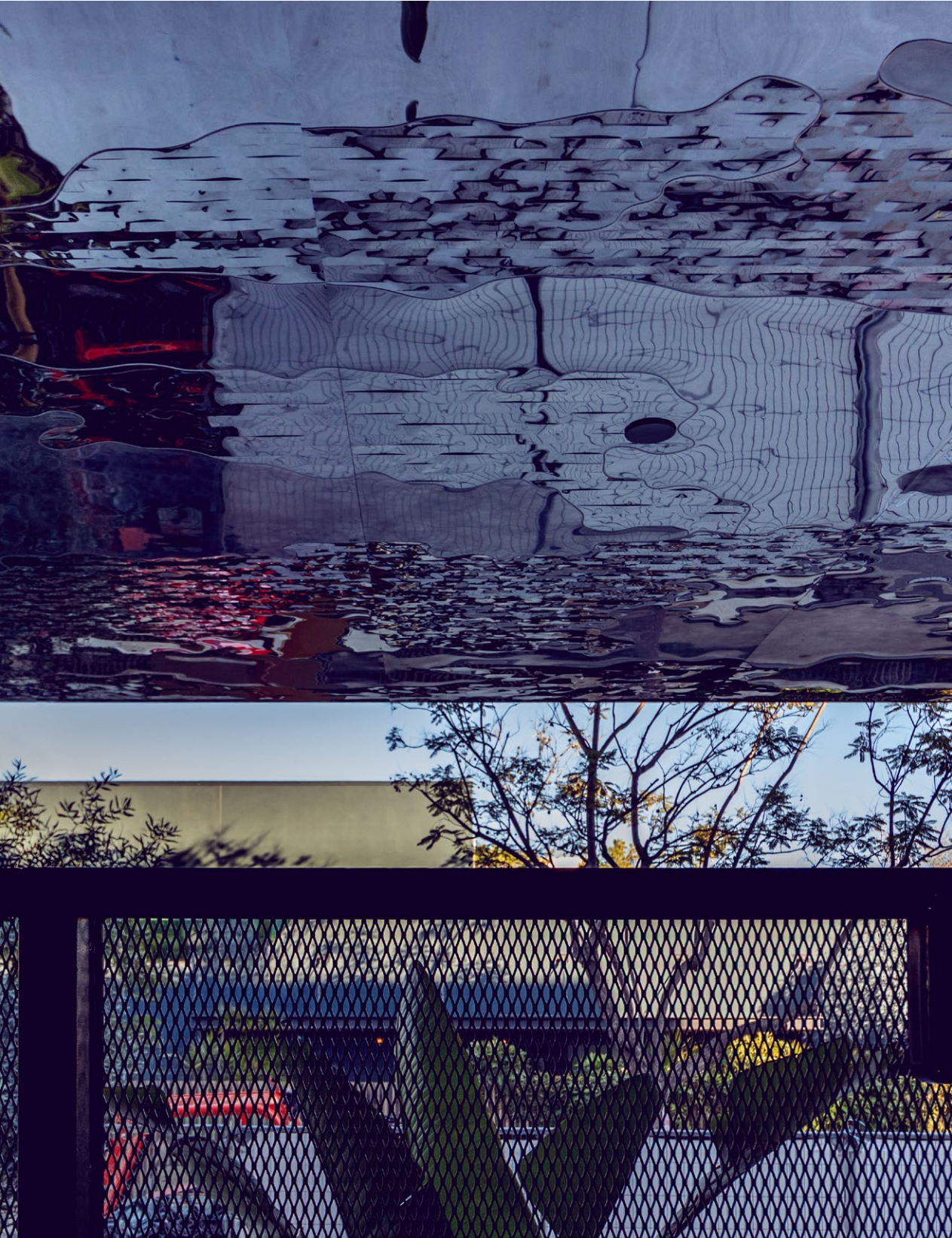
717 Seward St 'Cloud Illusion' Art Installation x Astrid Krogh's.