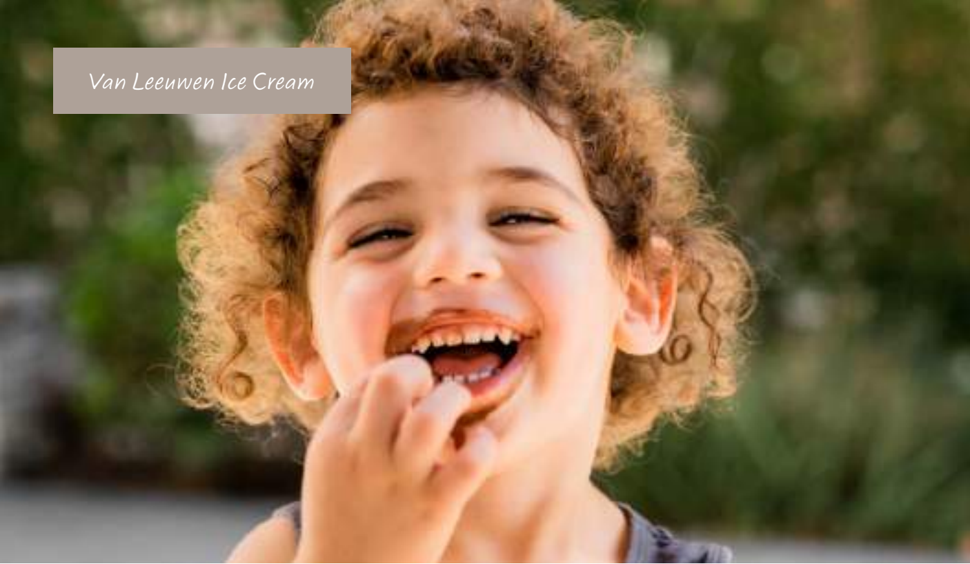
Van Leeuwen Ice Cream

A thoughtfully curated mix of tenants offering premium dining, retail, and lifestyle experiences.