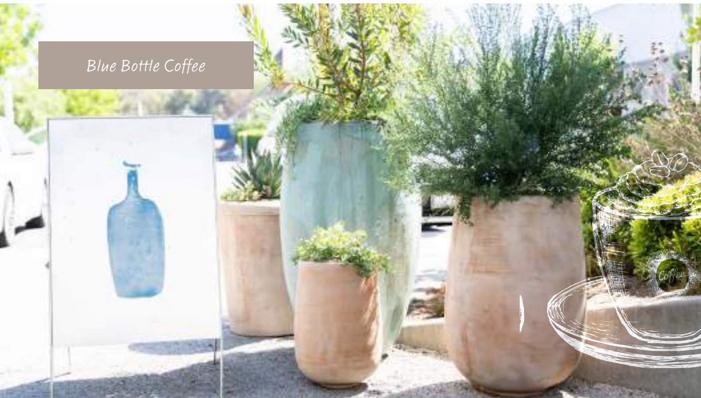
Blue Bottle Coffee

At Valley Country Market, there is something for everyone.